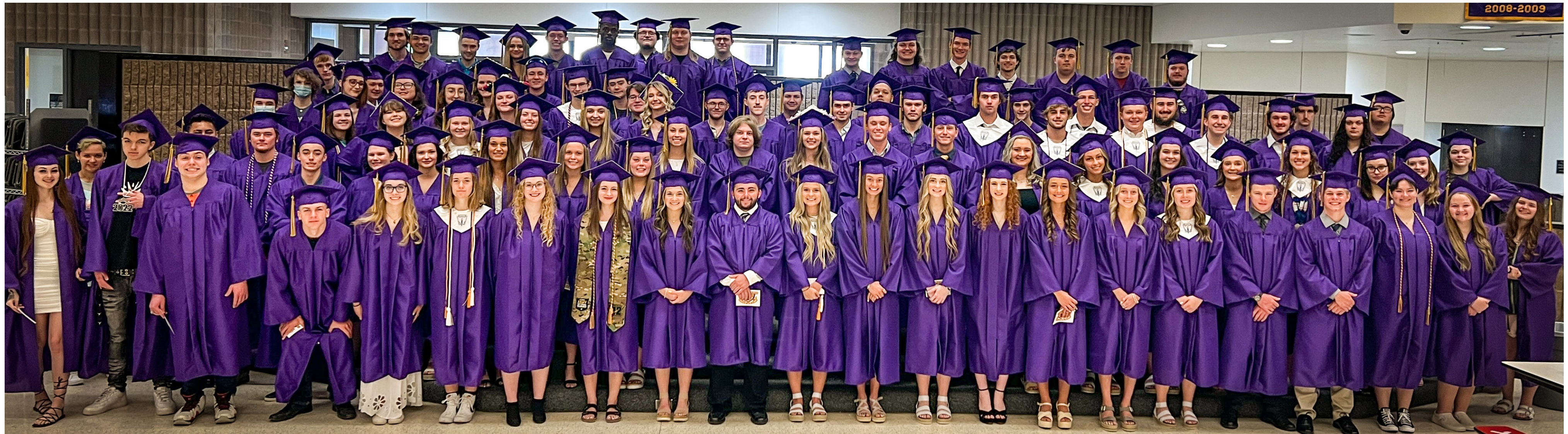
Above, the graduating class of 2022 pose for a photo before the graduation ceremony held on May 22, 2022. More photos found in 'Albums' on the district Facebook page, or go to www.sherrard.us.

Sunday, May 22, 2022 - The school band played “Pomp and Circumstance” arranged by Edward Elgar as graduates walked through a warm breeze onto the track to take their seats. It’s the second year the school held the commencement ceremony outside - and the weather cooperated just as perfectly as it did in 2021.