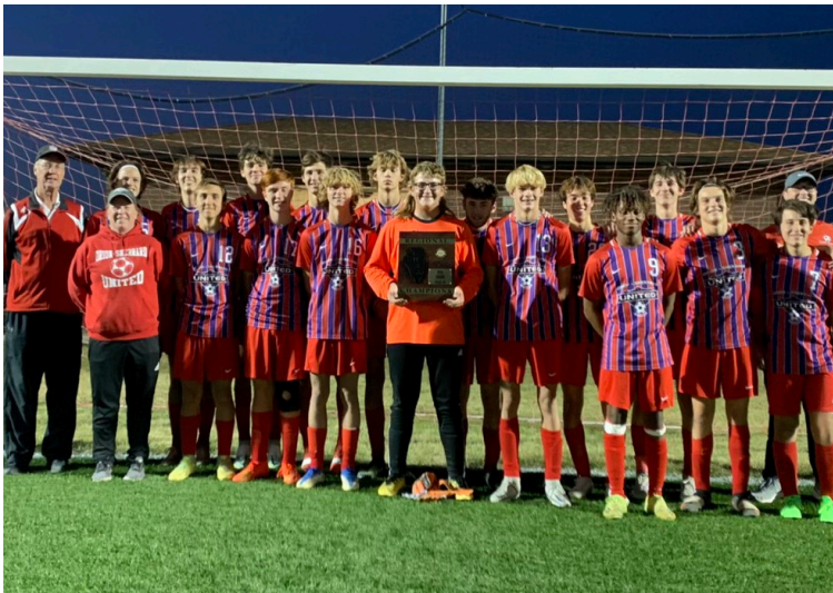
The high school boys Orion-Sherrard soccer team ended the season a record-breaking, history-making first ever regional championship win. Their record was 21-4-3.