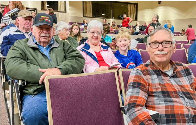
Above, Veterans in attendance patiently waited in the auditorium - where donuts were served prior to the ceremony. Cala Smoldt

district were asked what Veterans Day means to them. A compilation of students answers from across the district played during the assembly. The video can be