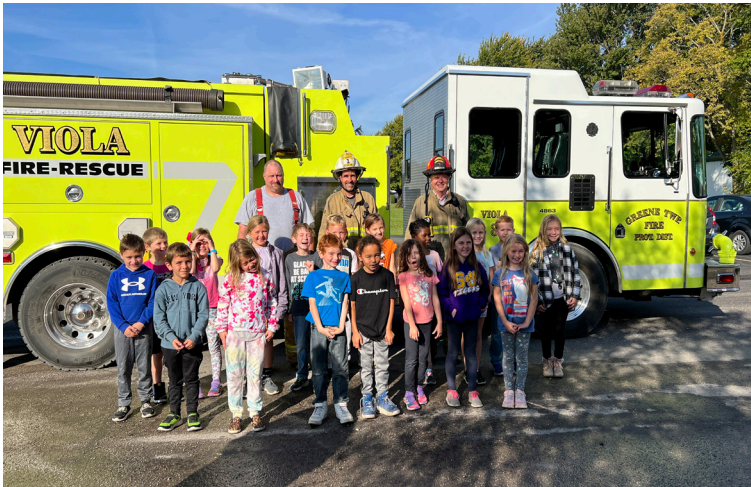
Above, Firefighters pose with students following a fire drill at the elementary school in October. Cala Smoldt